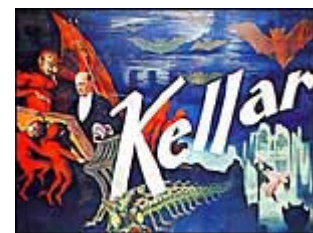
Harry Kellar (1849-1922)

Many of my lodge members know my passion for magic and clowning and as a member of International Brotherhood of Magicians (IBM), I will be sharing articles on famous Masons in the entertaining arena.