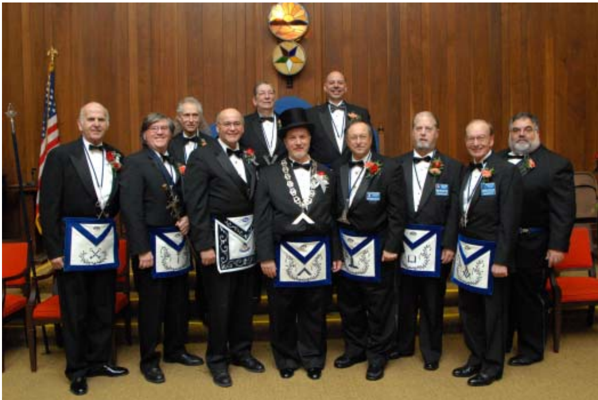
Meet your 2010 Officers

Brethren celebrating their birthday are invited for a complimentary dinner.