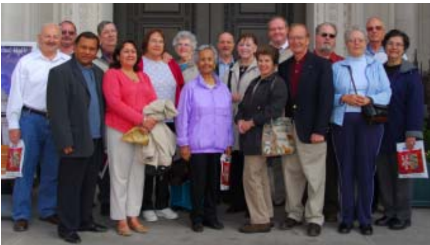
Brethren and Ladies visiting Grand Lodge of England