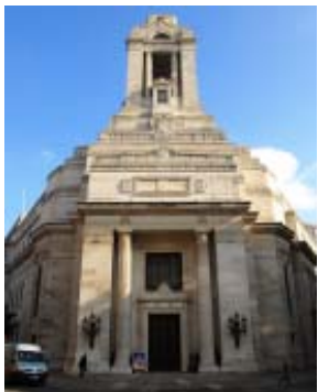
Grand Lodge of England

We Commend the Soul of our Dear Departed Brother