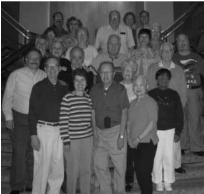
Golden Gate Speranza Group on board Regal Princess cruising Alaska